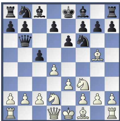
(3) The Torre Attack – Spassky Gambit