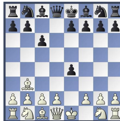
(2) The Caro-Kann – Hillbilly Attack